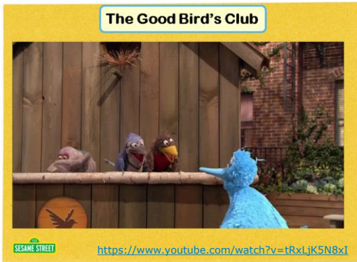
22 | Early Childhood Investigations Webinar Child Trends